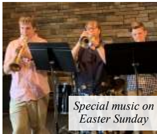
Special music on Easter Sunday

I am happy to say our choir has grown throughout this year, but we are always looking for new singers, especially male voices . Please come to a first-Wednesday-of-the-month, 6:30 p.m. rehearsal and try us out! (The choir warms up and refreshes at 8:15 a.m. on the Sunday