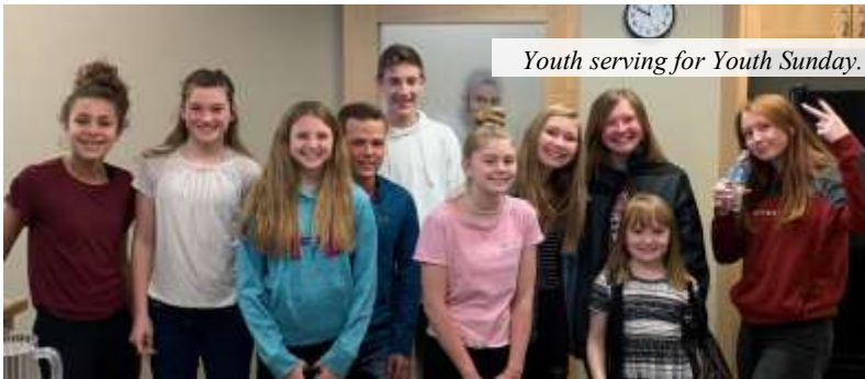
Youth serving for Youth Sunday.