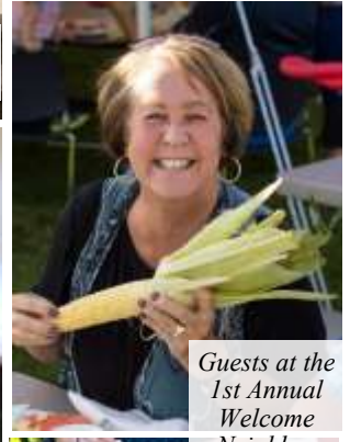
Guests at the 1st Annual Welcome Neighbor Corn Feed