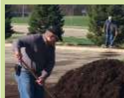
Volunteers spreading mulch on church cleaning day.