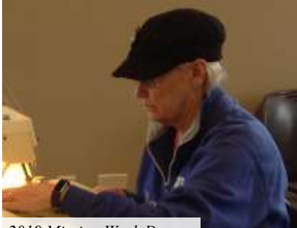
2019 Mission Work Day