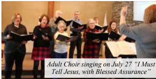
Adult Choir singing on July 27 "I Must Tell Jesus, with Blessed Assurance"