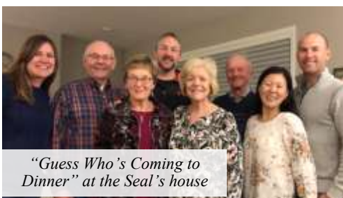
"Guess Who's Coming to Dinner" at the Seal's house