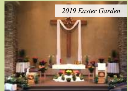
2019 Easter Garden

Please contact Barb Schansberg at brbshg@aol.com or call 763-595-1138.