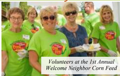
Volunteers at the 1st Annual Welcome Neighbor Corn Feed

In October we hosted a table at the Watertown Ladies' Night Out. We gave out 200 cookies with information for our