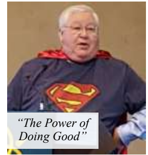
"The Power of Doing Good"