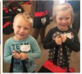
The McClurg children helped with blessing bags.