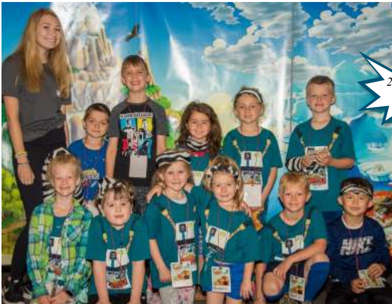
2019 VBS "In the Wild"